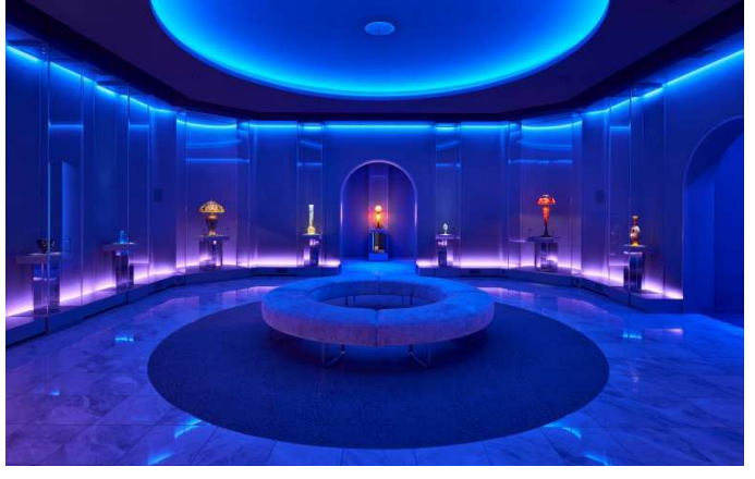
*Actual photograph, altered lightly from the original.