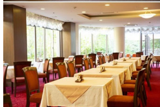
Interior of Regius Momochi

* The amount of lump sum payments upon admission are as of May 10, 2019.