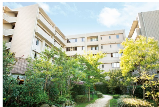
Exterior of Felio Momochi