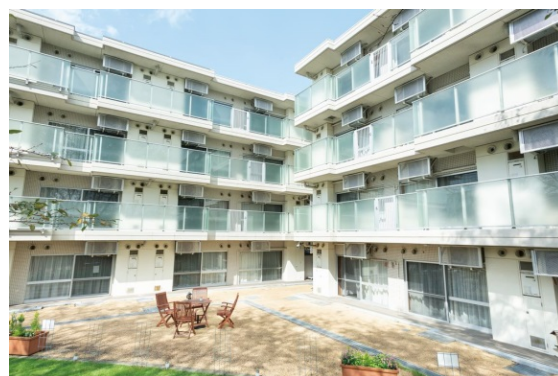
Exterior of Felio Seijo