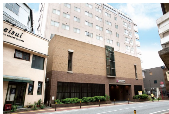
Exterior of Felio Tenjin