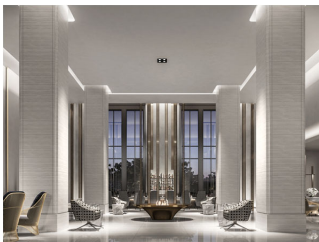
Hotel / Reception

SANCTUARY COURT TAKAYAMA is unprecedented as an “ART GALLERY RESORT” that brings together a hotel and an art museum. Adjacent to the hotel, the art museum has inherited the three stars received by the former Hida-Takayama Museum of Art from Michelin Japan The Green Guide, and exhibits works of fine art from around the world. With art adorning every corner of the building, an exceptional space is created where guests can feel as though they are in an art gallery.