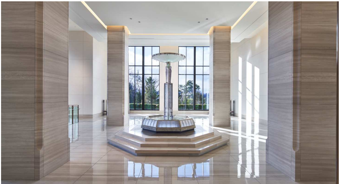
Art Gallery Lobby(Centerpiece: “The Fountain in the Champs-Élysées Shopping Arcade” by René Lalique)

*Non-members can also access the museum, which is scheduled to open to the public on Thursday, April 11, 2024.