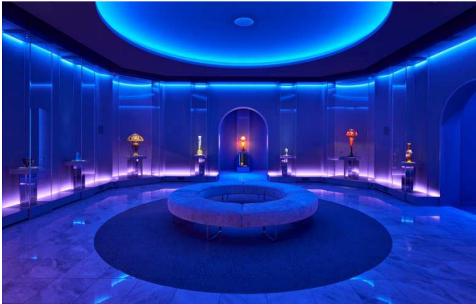
*Actual photograph, altered lightly from the original.