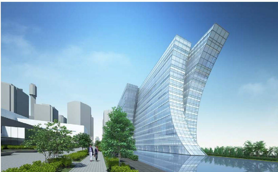
Construction plan of the hotel – the right of the sidewalk (image)