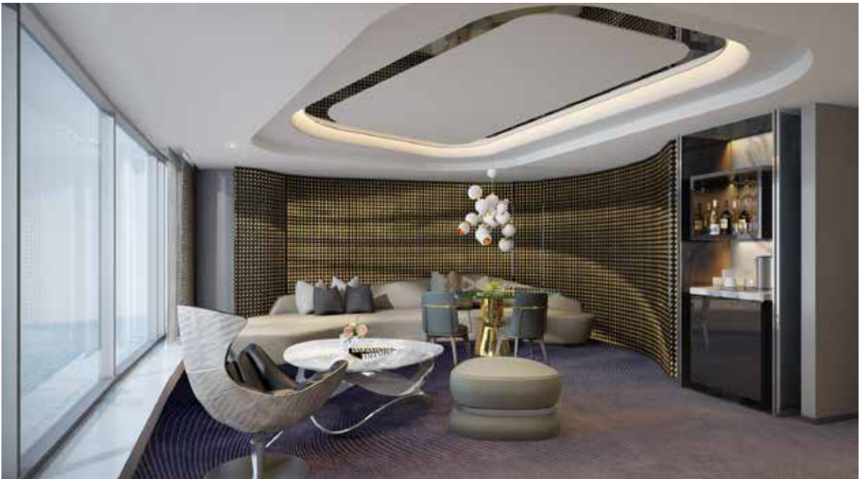
“Royal Suite Room,” with its striking gold wallpaper