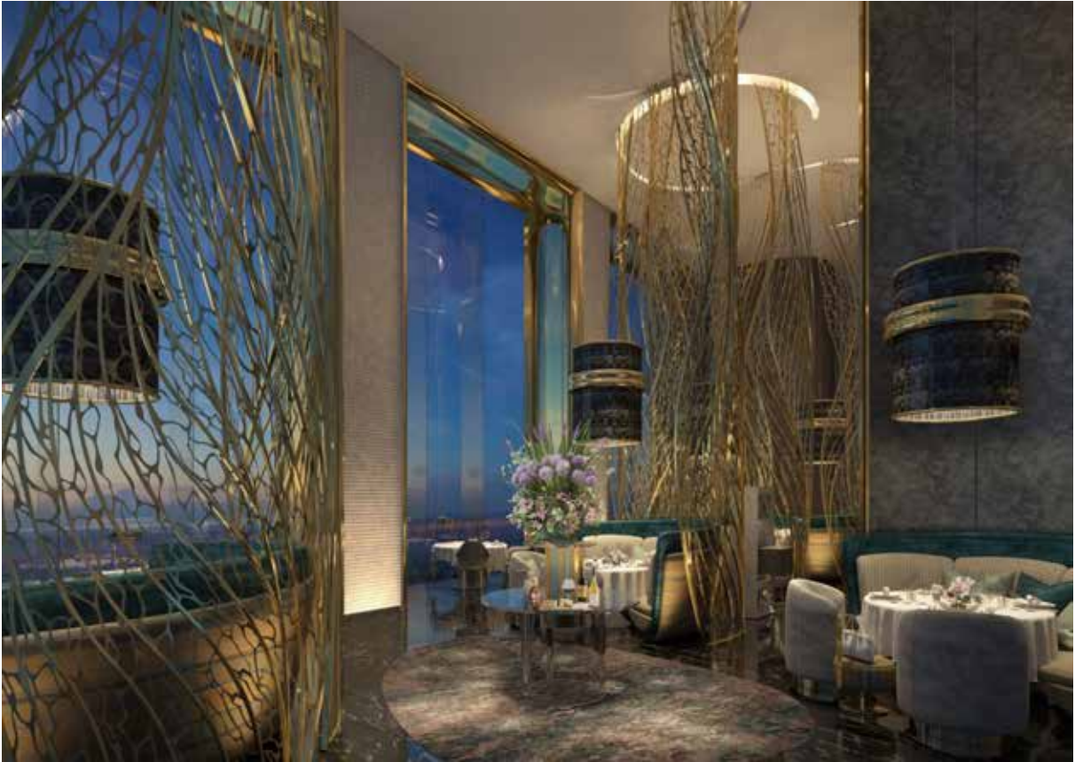
“Main dining,” where light and dark accents produce beautiful contoured silhouettes