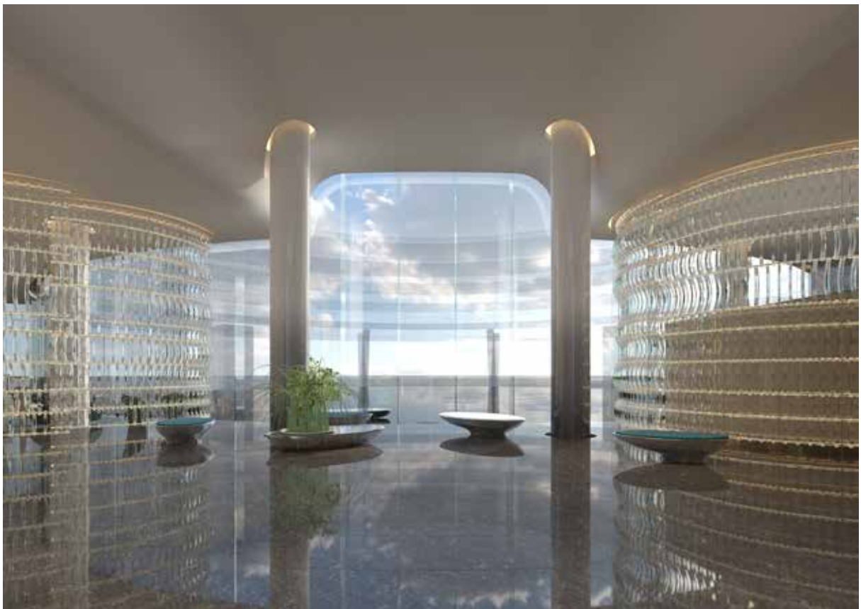
Dreamy “entrance lobby,” memorable for the light reflected by its glittering glass