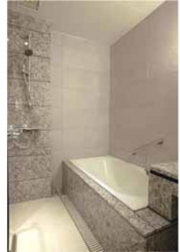
Bathroom equipped with shower booth