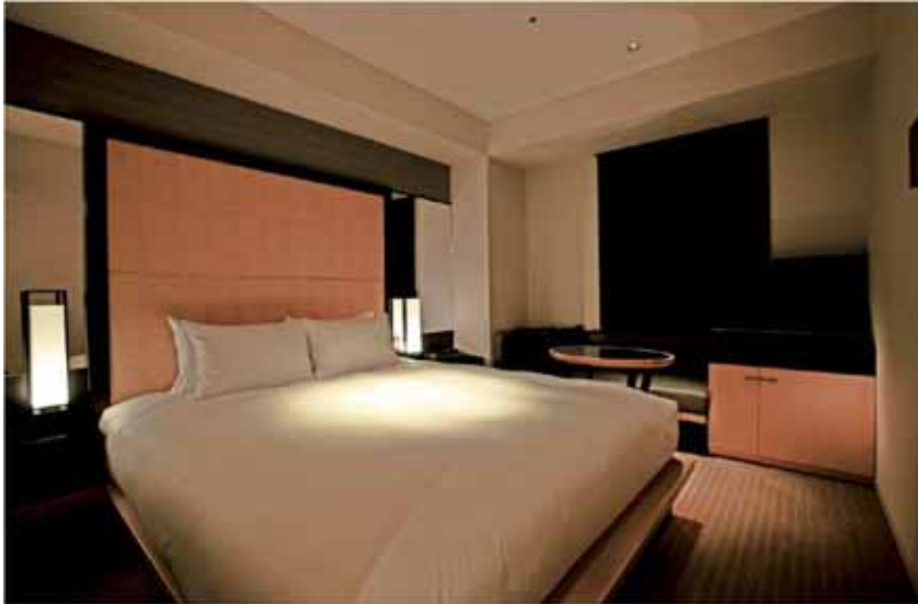
Standard Double Room

Bathrooms are equipped with shower booths, excluding Standard Single Rooms and Barrier Free Rooms.