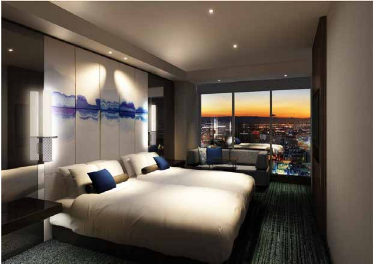
【Guest room】Twin room