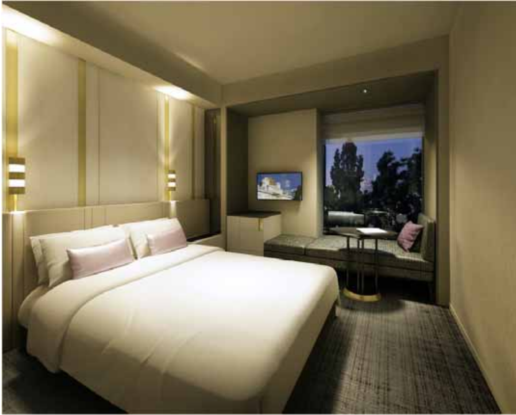
【Guest room】 Double room