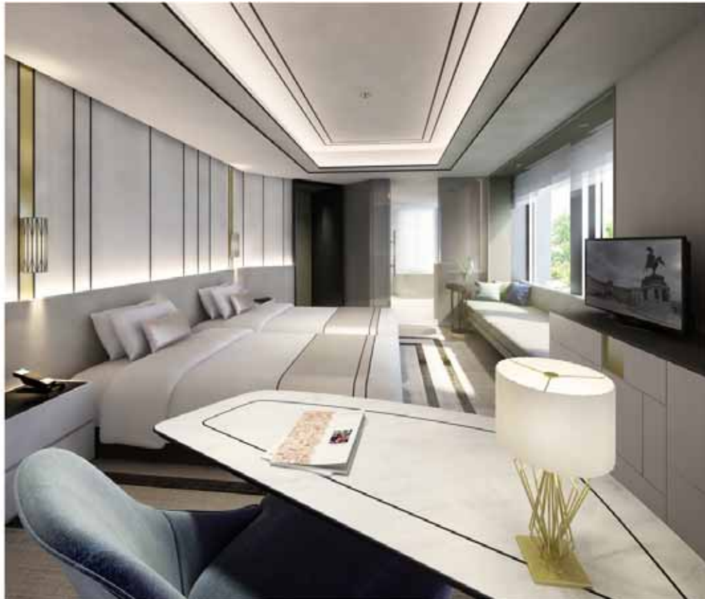
【Guest room】 Deluxe twin room