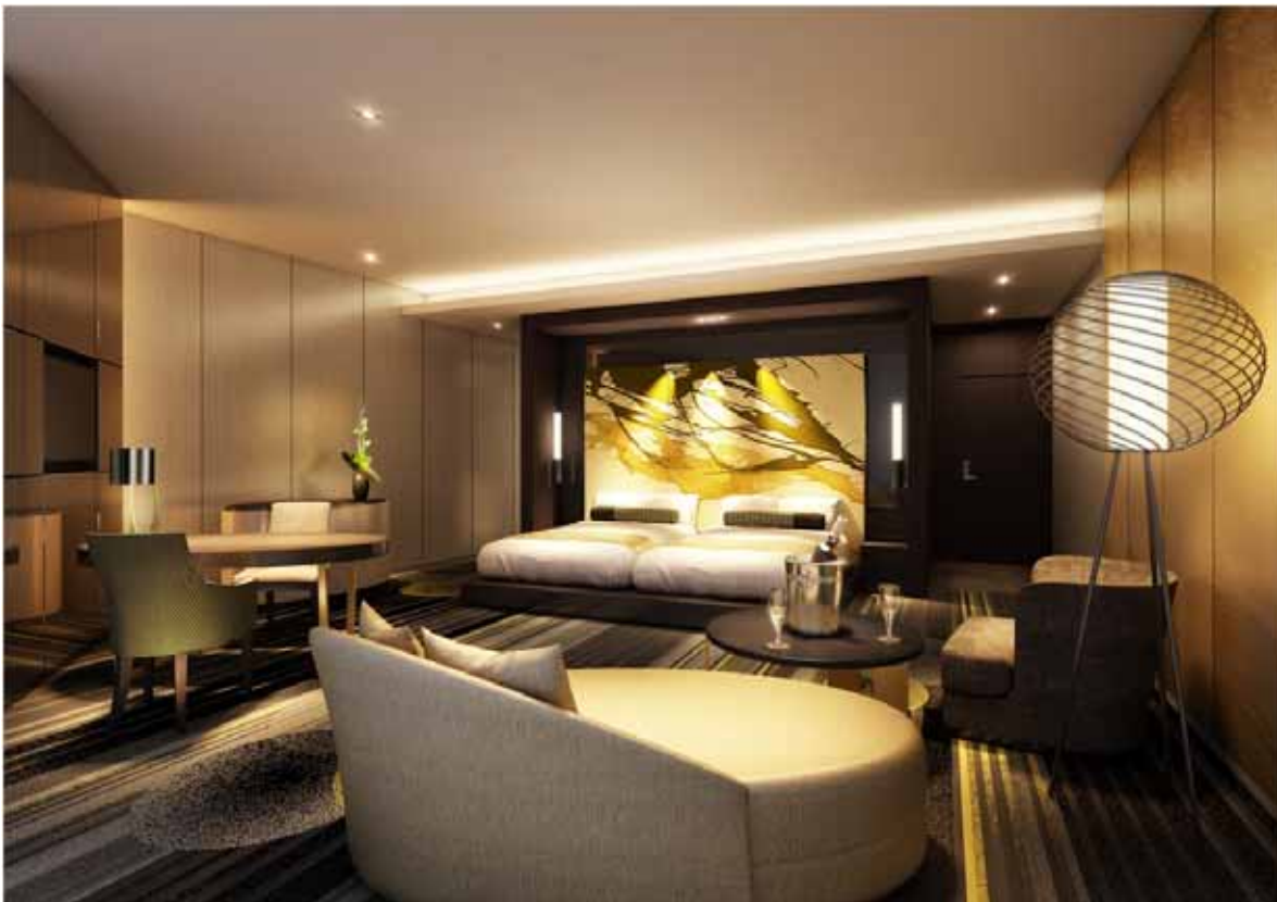
【Guest room】 Suite room

The “Kumamoto City Plan Sakuramachi District Type 1 Urban Redevelopment Project” is a plan to build a facility complex that includes the Kumamoto-jo Castle Hall, a bus terminal and commercial facilities. The Company will take a part in the building of the hotel.