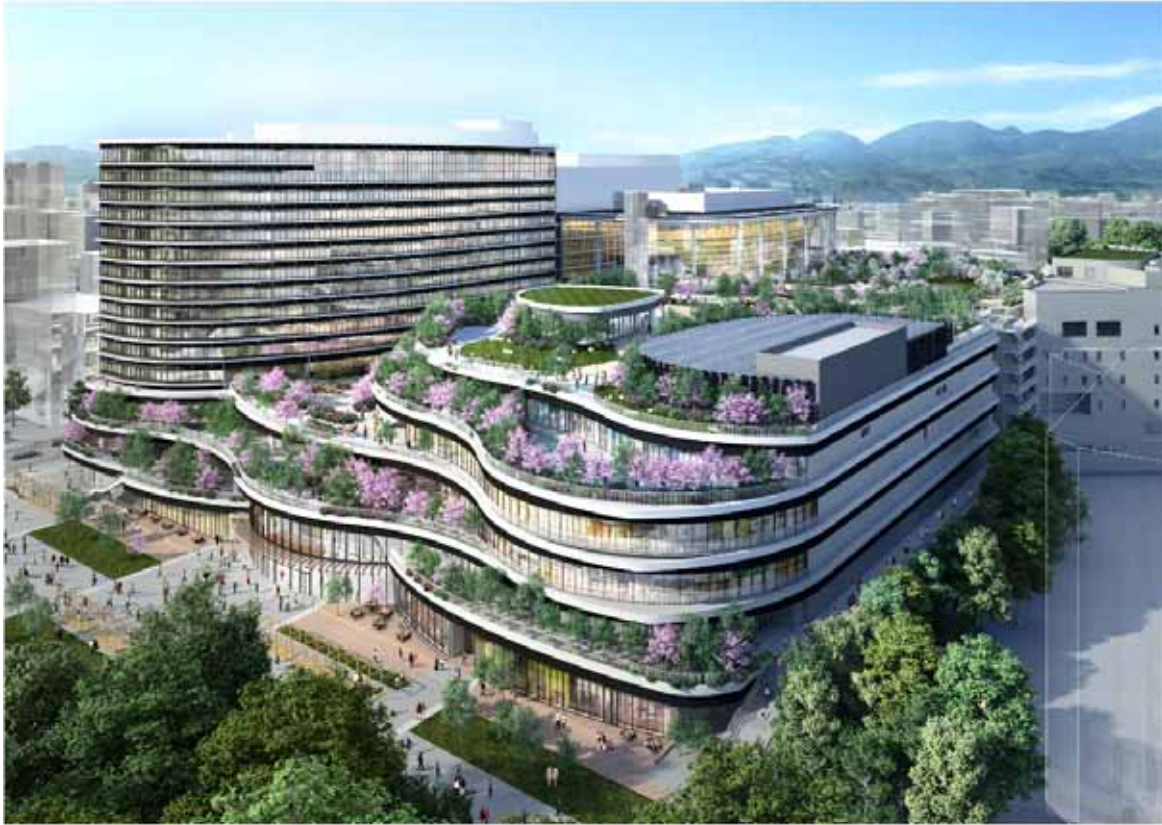
【Exterior】Kumamoto City Plan Sakuramachi District Type 1 Urban Redevelopment Project (image)

The “Kumamoto City Plan Sakuramachi District Type 1 Urban Redevelopment Project” is a plan to build a facility complex that includes the Kumamoto-jo Castle Hall, a bus terminal and commercial facilities. The Company will take a part in the building of the hotel.